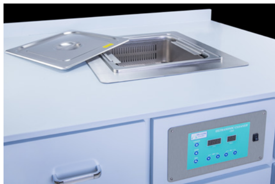
Shown with standard CK3 control panel.