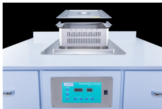
Standard flush mount control panel

>>> Serial number and model number required for all parts orders. <<<