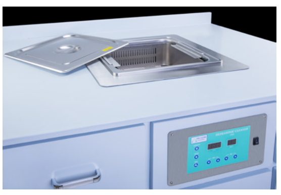
Shown with standard CK3 control panel.